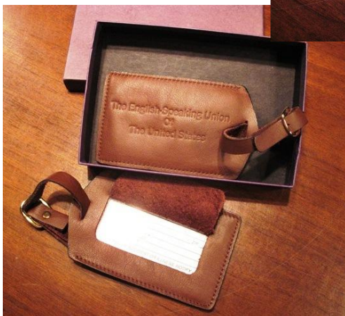
Leather Luggage Tags $20.00 set of 2