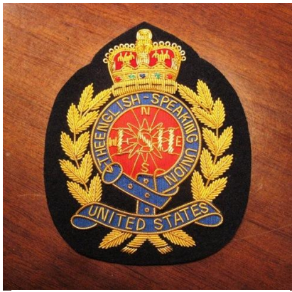
Embroidered Blazer Patches $50.00