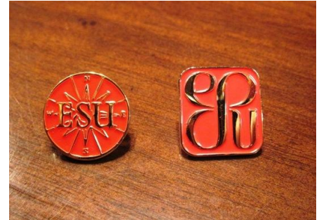
Lapel Pins $10.00