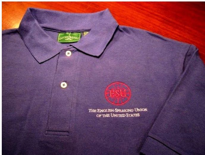
Embroidered Polo Shirts $30.00