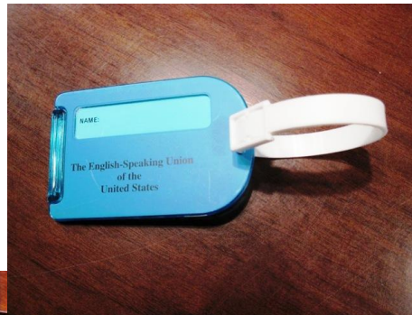
Neon Blue Luggage Tags $3.00