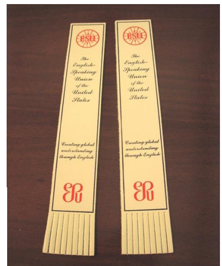
Leather Bookmarks $6.00 set of 2