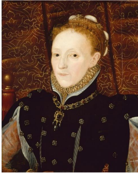
Elizabeth I; about 1570; George Gower, 1540-1596

The Denver Branch of the English-Speaking Union is partnering with the Denver Art Museum to sponsor the "Spotlight on Conservation" program, June 14, 2019 in Conjunction with the Treasures of British Art: The Berger Collection