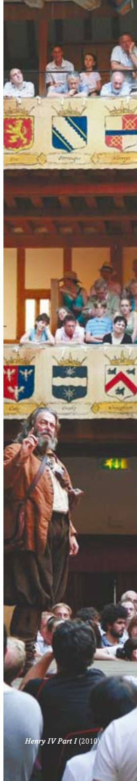
Henry IV Part I (2010)