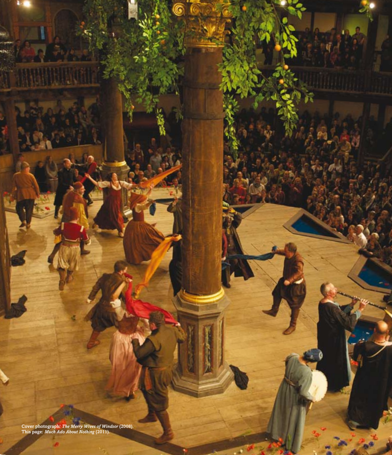
Cover photograph: The Merry Wives of Windsor (2008). This page: Much Ado About Nothing (2011).