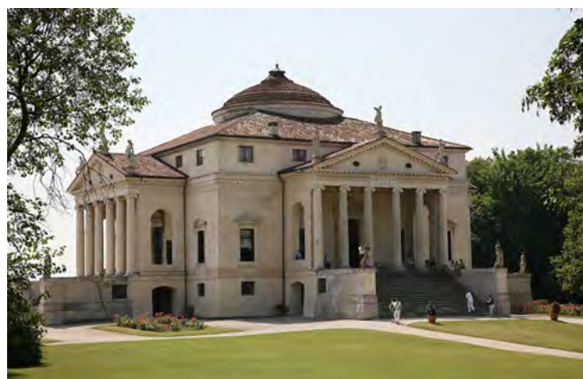
Villa La Rotonda