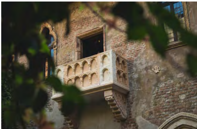
Romeo and Juliet balcony in Verona