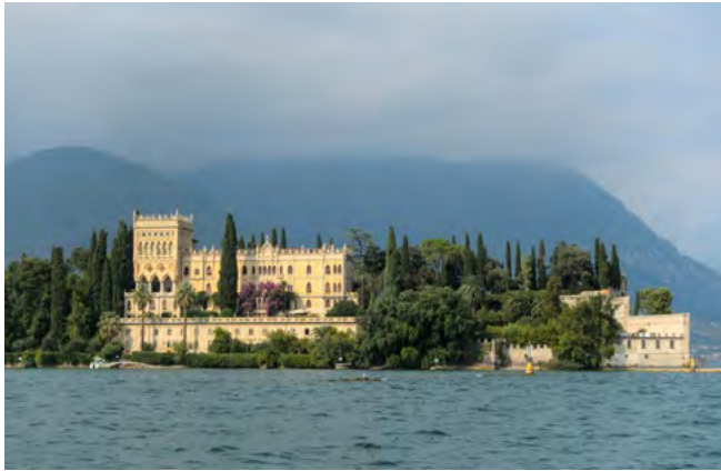
Isola del Garda