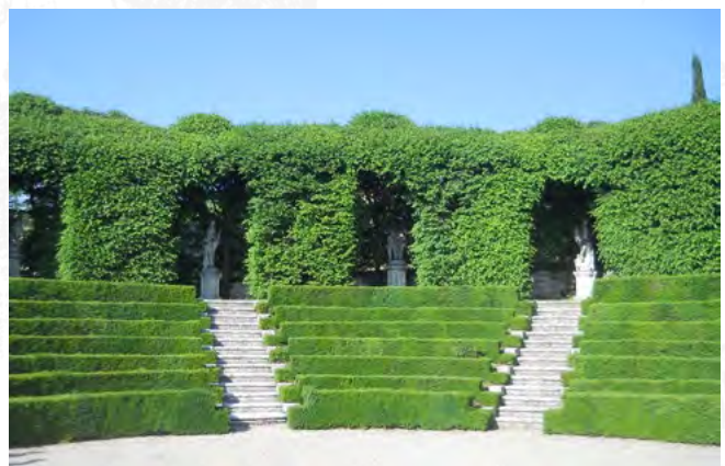
Gardens at Villa Rizzardi