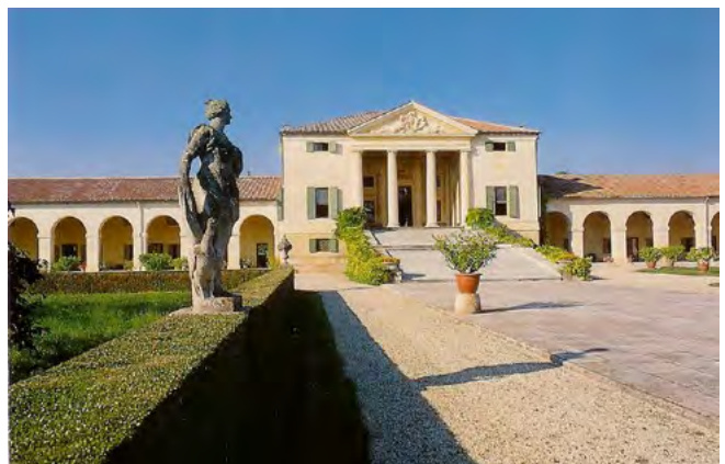
Villa Emo in Fanzolo