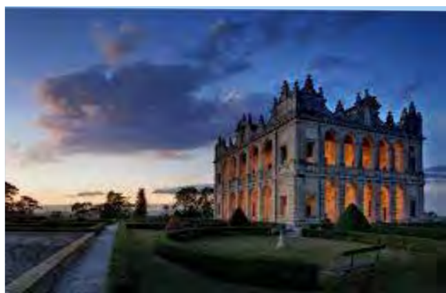
Villa Emo Capodilista