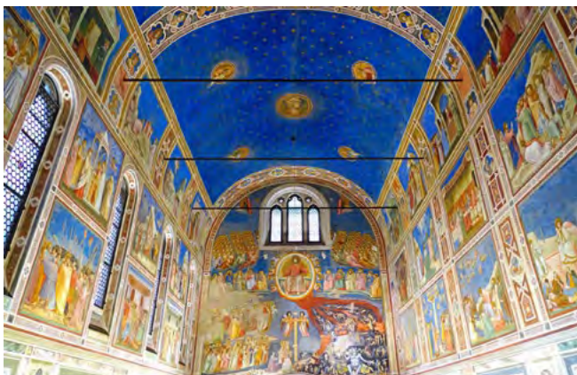
Cappella degli Scrovegni