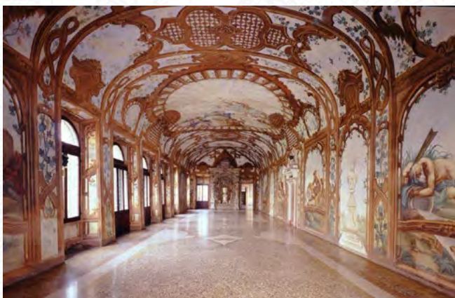
Palazzo Ducale, Mantova