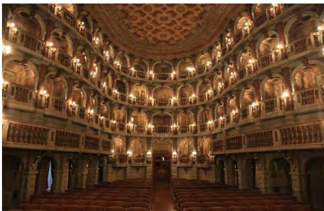
Teatro Scientifico del Bibiena