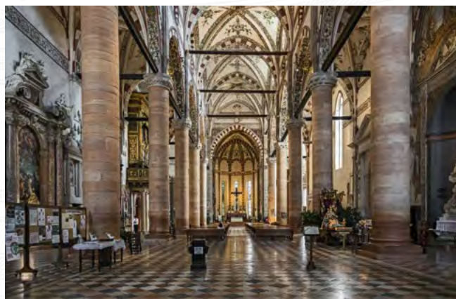
Chiesa Di Sant'Anastasia

Started over fifty years ago, the Collection Carlon in the Palazzo Maffei, is an eclectic collection grown without chronological limits dedicated to paintings, sculptures, engravings, drawings, miniatures, old books, but also pottery, bronzes, ivories, objects of daily life such as furniture and decorative objects, from antiquity to the present day.