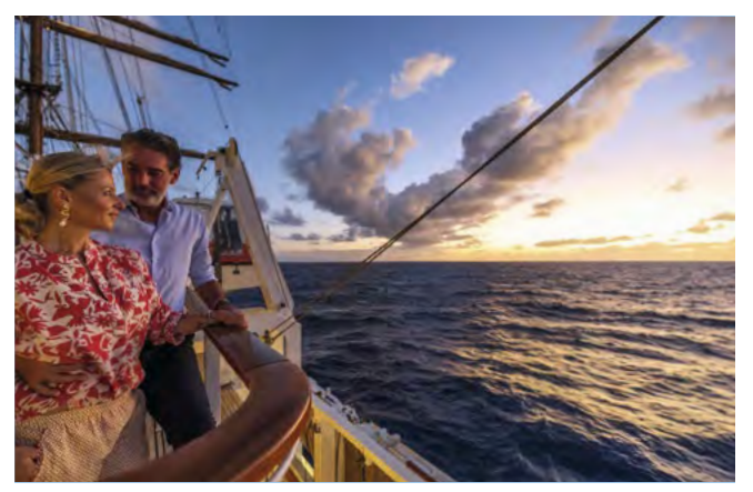
Sea Cloud Spirit