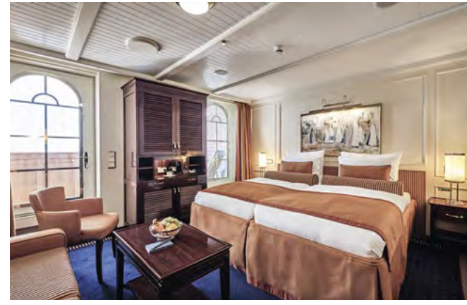
Sea Cloud Spirit