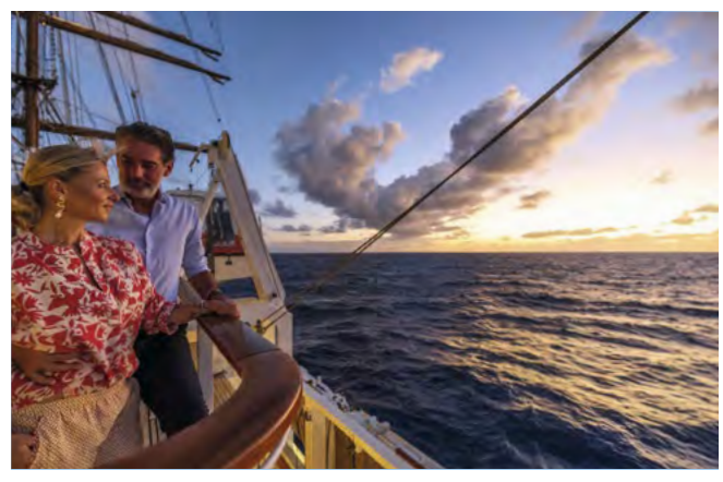
Sea Cloud Spirit