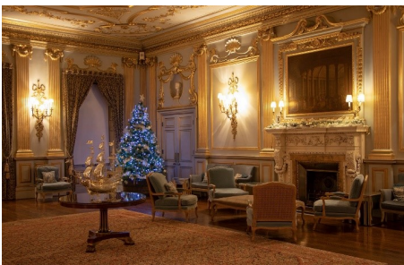
Knowsley Hall at Christmas